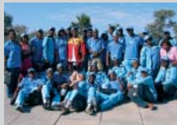
Delegates from Central Region