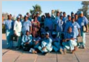
Delegates from Western Region