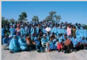
Delegates from Northern Region