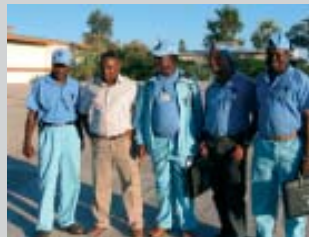
NAPWU Branch Organisers

Delegates NAPWU 8 th National Congress, May 2007, Ongwediva College of Education