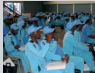
Viva NAPWU Viva NUNW