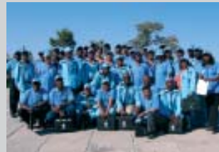
Delegates from Southern Region